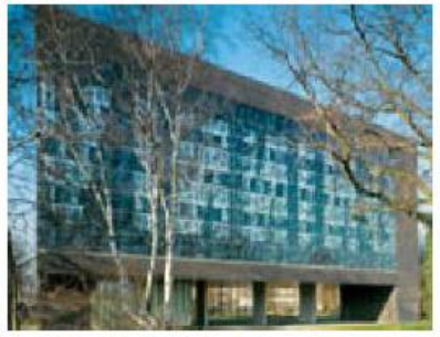
Twinning Center, Eindhoven, The Netherlands • Architects : Tomassen and Vassen

To maintain its attractive appearance, SGG SERALIT EVOLUTION must be regularly cleaned with neutral agents that are free from harsh abrasive materials.