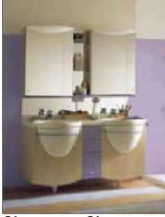
Showroom, Champagnole, France

They will receive the relevant CE marking when this is applicable.